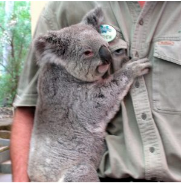
Koala in Wildlife Park