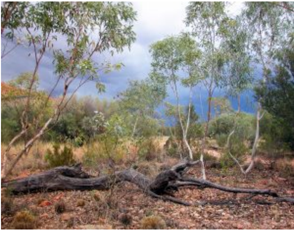
Gum trees near Alice Springs